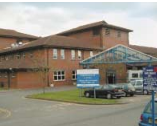
Rowley Regis Hospital