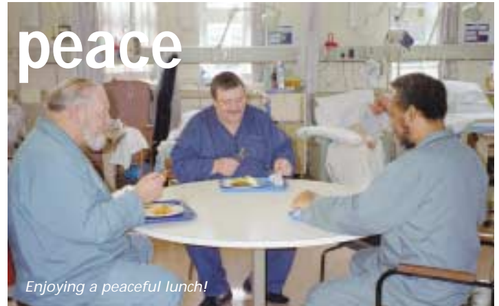
Enjoying a peaceful lunch!

year. The new restaurant, due to open early Autumn will give the staff, patients and visitors a modern, comfortable environment serving a complete range of food.