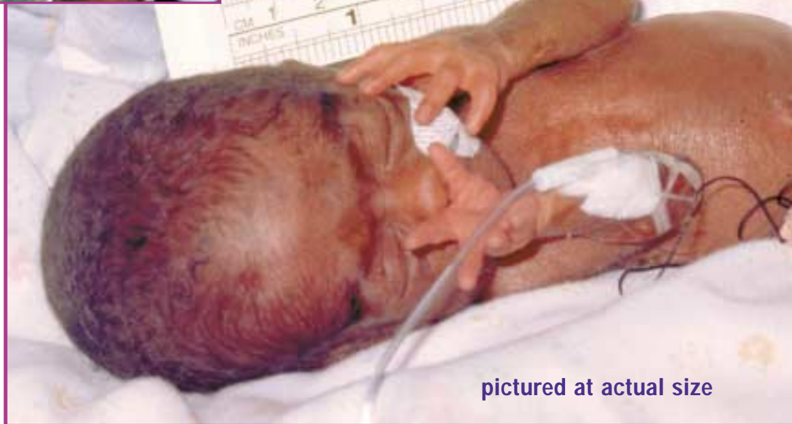
pictured at actual size

"She truly is a miracle baby. In the 20 years I have been working here I have never come across such a tiny baby"