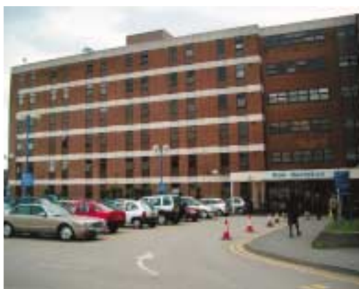
Sandwell General Hospital