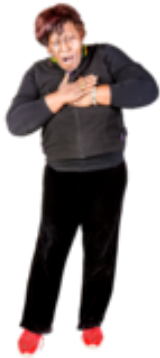
Signs of a heart attack.