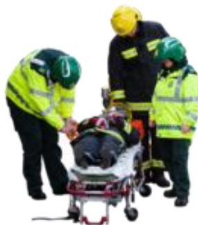
Severe injuries or sudden swelling.