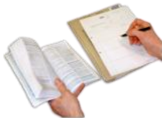
If you need a prescription.