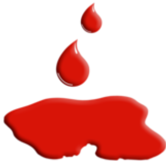
Excessive blood loss. Excessive means lots.