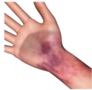
Injuries like cuts and bruises.