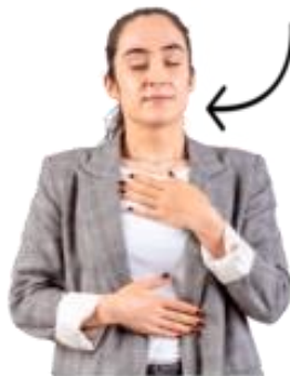
Severe difficulty breathing.