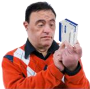
A suicide attempt.