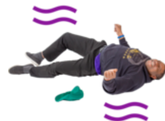
Seizures and fits.