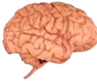
Signs of a stroke.