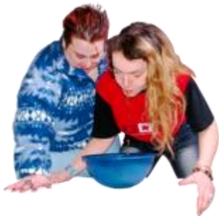
Stomach pain, being sick and having an upset stomach.