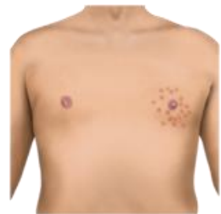
Skin infections and rashes.