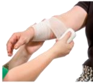
Strains and Sprains.